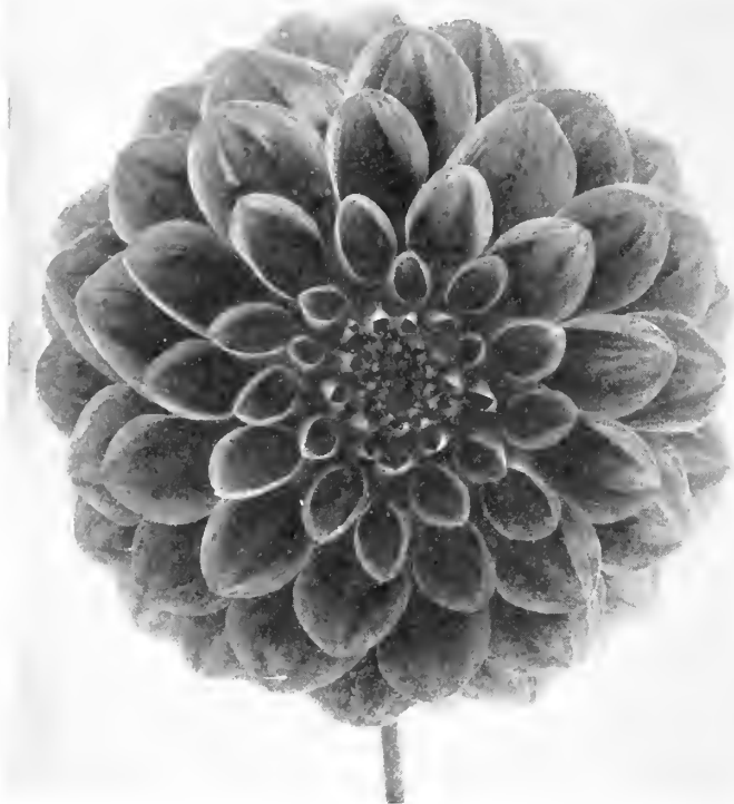
Velvet Ball (Description on page 21)